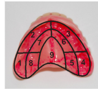
Figure 1: Superimposition of the standardized grid proposed by Schubert and Schubert (1979) on denture images for application of the DHI.